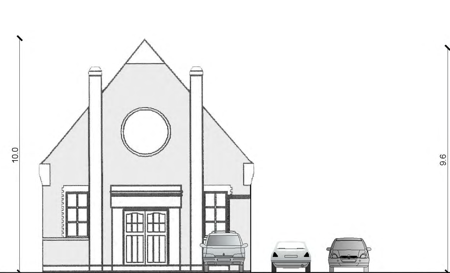
Front elevation of Memorial Hall facing Lymington Avenue East facing elevation to Lymington Avenue