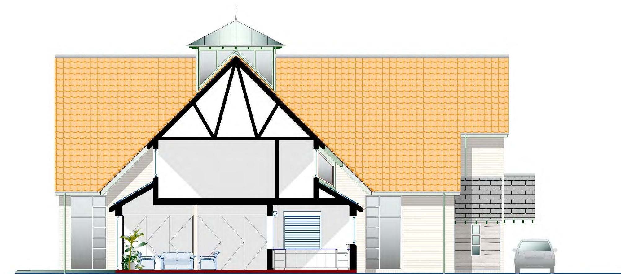
Section Through Admin Office/Foyer Space Section Through Courtyard Sectional Elevation Looking East BB